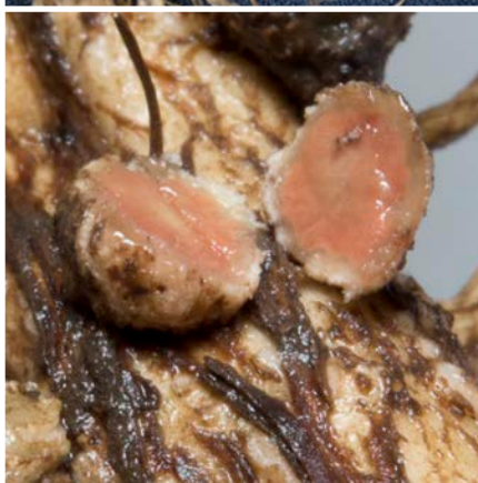
Nodules on soybean roots (top picture). A healthy soybean nodule that is actively fixing nitrogen will have a red to pink color when split open (bottom picture). Nodules not actively fixing nitrogen will have a grayish color.